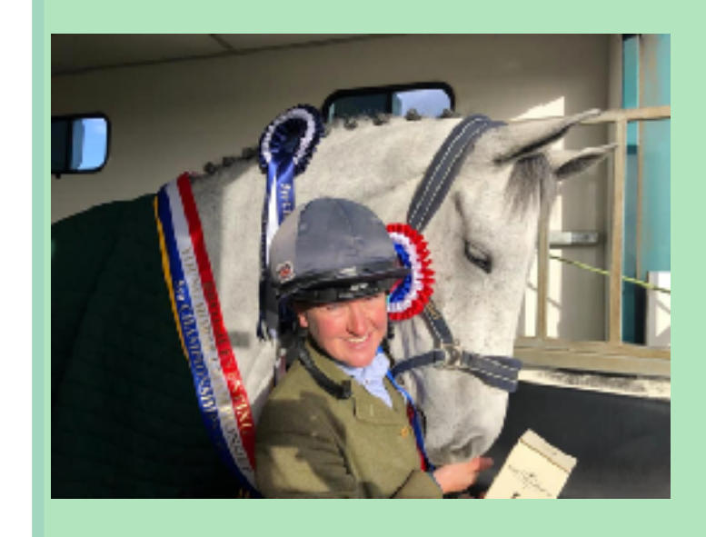
DE PLEASURE 5yo By Diacontinus

Aims 2021, Novice / 6 year old Championships